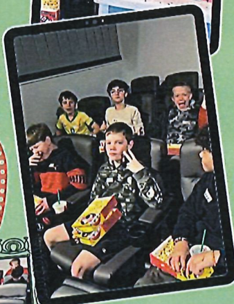
6th graders getting ready to watch the movie.